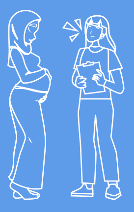
PREGNANT WOMAN SHOULD BE UNDER THE CARE OF A HEALTHCARE PROVIDER