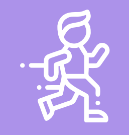
60 MINUTES PER DAY MODERATE- TO VIGOROUS-INTENSITY