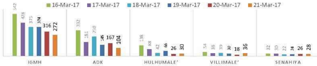
Figure 2: Flu clinic consultation (އިންޓަރވިއުއެންޝަން) numbers of atolls up to 21 st Mar 2017