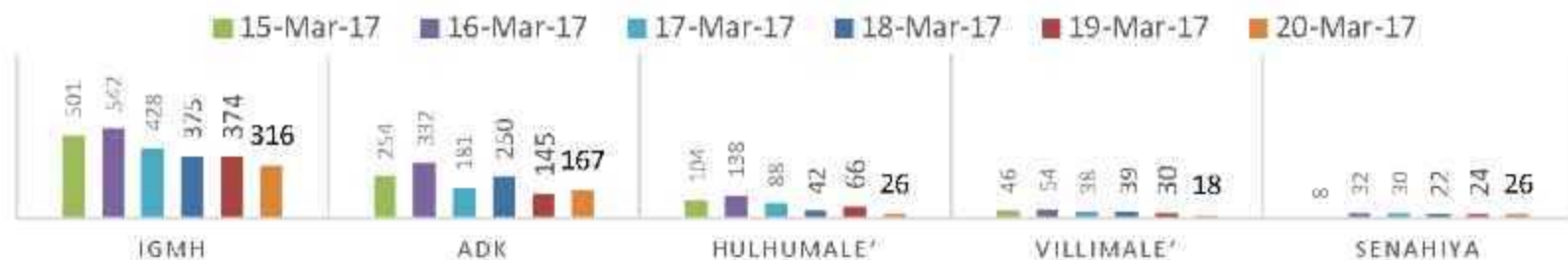
Figure 2: Flu clinic consultation (އަދިރިފުޅުވުމުގެ އަދަދު) numbers of atolls up to 20 th Mar 2017