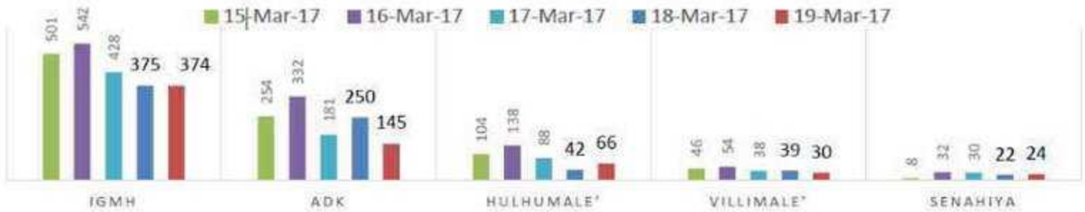
Figure 2: Flu clinic consultation (އިއިރުފުސާތައް) numbers of atolls up to 19 th Mar 2017