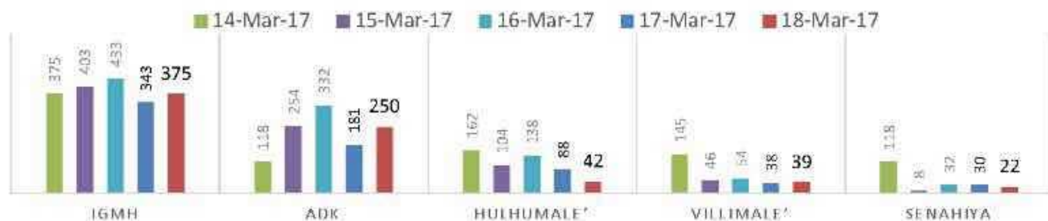
Figure 2: Flu clinic consultation (އަދިރާދަފުސާ) numbers of atolls up to 18 th Mar 2017